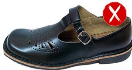
Year 2 to Year 6